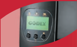
Upgraded Graphic LCD