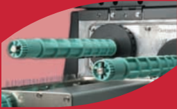
Ribbon supply and rewind module