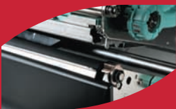
Adjustable sensor kit